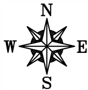
EXHIBIT C - page 2